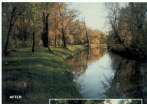
BENEATH THIS VERDANT SETTING A MATRIX OF CONCRETE HOLDS THE STREAMBANK IN PLACE.

As the drawing above shows, the finished product presents a totally biological